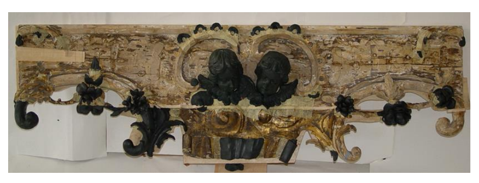
Figure 60. The lower frame listel to the icon Mikhail Malein and John the Warrior . Modelling the loss of carved decor in plasticine