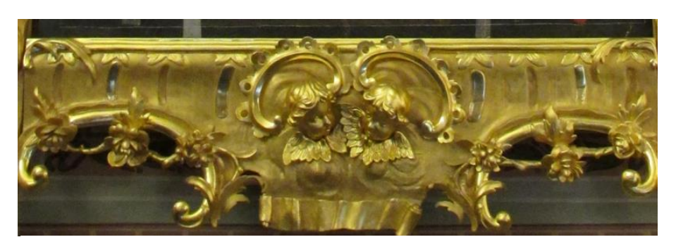
Figure 62. The lower frame listel to the icon Mikhail Malein and John the Warrior after a comprehensive restoration