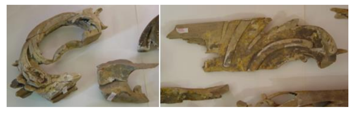
Figures 10-11. The loss of fragments of the carved decor of the frame and strong persistent surface contamination of the surface of the frame parts