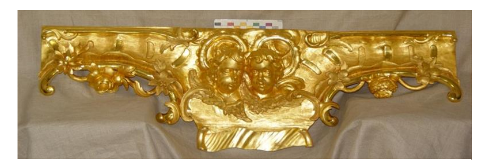
Figure 25. Frame for the temple icon Nicholas the Wonderworker in Life. The lower listel after a complex of conservation and restoration works