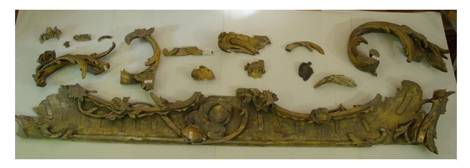
Figure 29. The left frame listel to the temple icon Nicholas the Wonderworker in Life before the restoration of the loss of the base with characteristic strong persistent surface contamination of the base and historical gilding