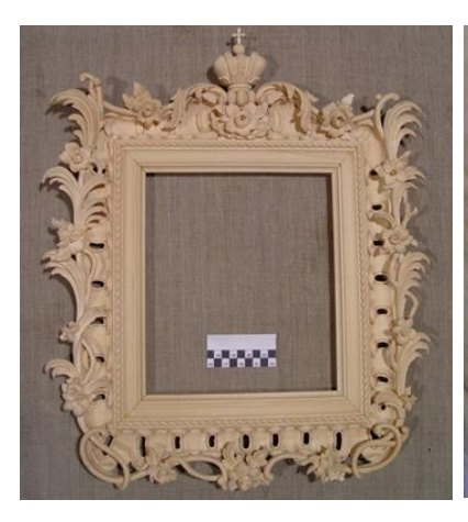
Figure 39. Execution of the frame to the image of Nicholas the Wonderworker according to the model in the wood of the linden tree