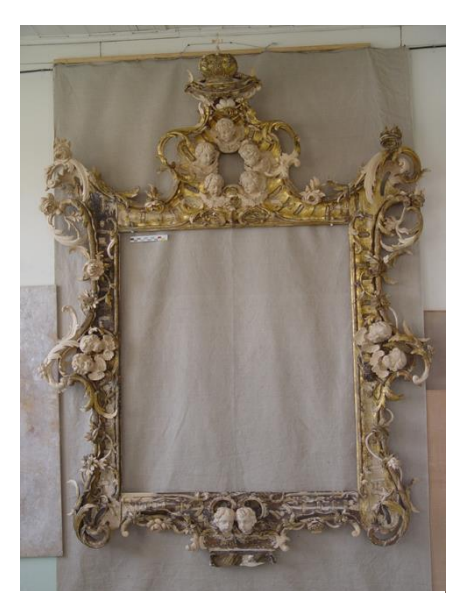
Figure 34. General view of the frame for the temple icon Nicholas the Wonderworker in Life in the assembly after a comprehensive restoration of the foundation and reconstruction of the loss of ornamental and sculptural carved decor