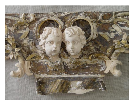
Figure 26. Fragment – the center of the lower leaf of the frame to the temple icon Nicholas the Wonderworker in Life before the conservation and restoration of the levkas and gilding, after the restoration of the loss of ornamental and sculptural wood carving