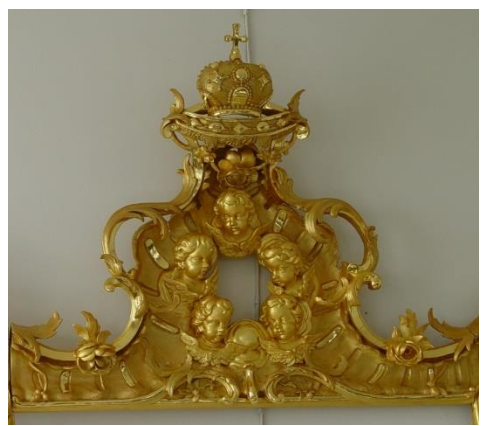
Figure 22. The frame for the temple icon Nicholas the Wonderworker in Life. The upper listel after performing a complex of conservation and restoration works