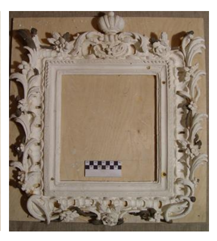
Figure 38. The transfer of the model from soft material to plaster to continue working in the authentic material of the monument – the wood of the linden tree