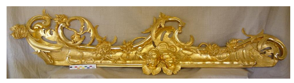
Figure 33. The right frame listel of the to the temple icon Nicholas the Wonderworker in Life after the preservation of the historical levkas with gilding, local soil replenishment. Gilding of two types and tinting of restoration gilding to match the color of the historical