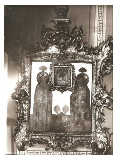
Figure 7. The frame and the temple icon Mikhail Malein and John the Warrior of the Sampson Cathedral after the restoration of 1909