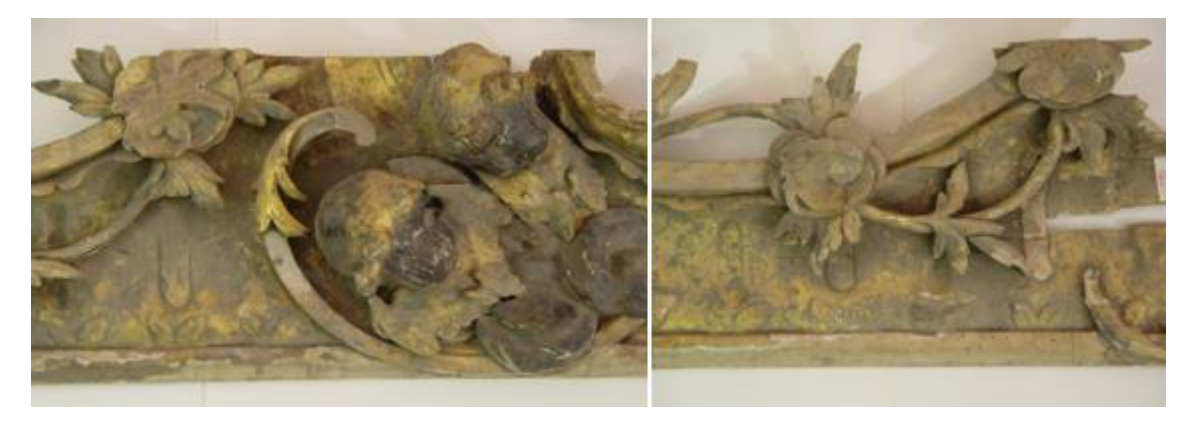
Figures 8-9. The loss of fragments of the carved decor of the frame and strong persistent surface contamination of the surface of the frame parts