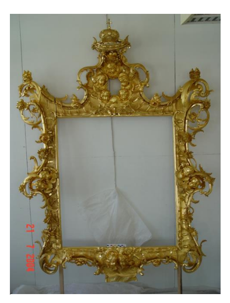
Figure 35. General view of the frame for the temple icon Nicholas the Wonderworker in Life in the assembly after a comprehensive restoration of the base and decorative decoration in the form of gilding