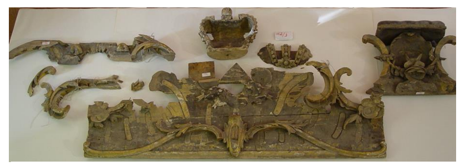
Figure 45. The frame for the icon Mikhail Malein and John the Warrior before the restoration of the base during the selection of authentic fragments for the restoration of the carved decor