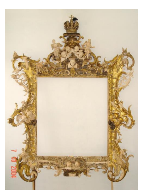
Figure 64. General view of the front side of the frame to the temple icon Mikhail Malein and John the Warrior in the process of restoration – recreation of carved and sculptural decor