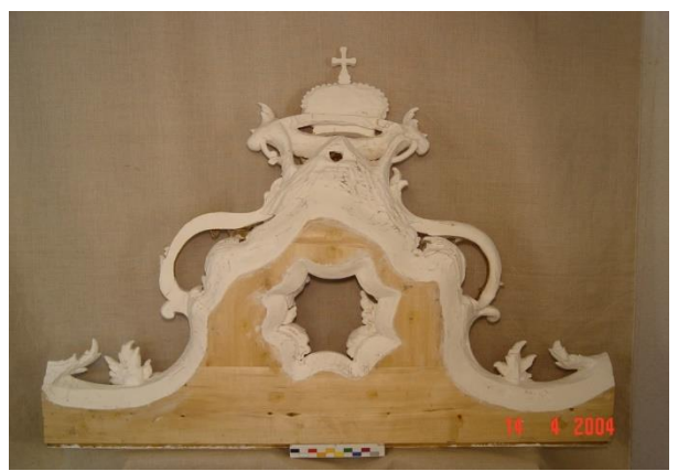
Figure 21. The frame and the temple icon Nicholas the Wonderworker in Life . The back side of the upper listel with a duplicated base in the process of recreating the lost ground-levkas