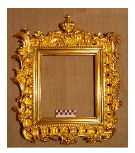
Figure 42. Execution of glossy gilding on a polymer and matte on a gulfarb, followed by tinting of restoration gilding to match the color preserved on the large frame to the icon Nicholas the Wonderworker in Life