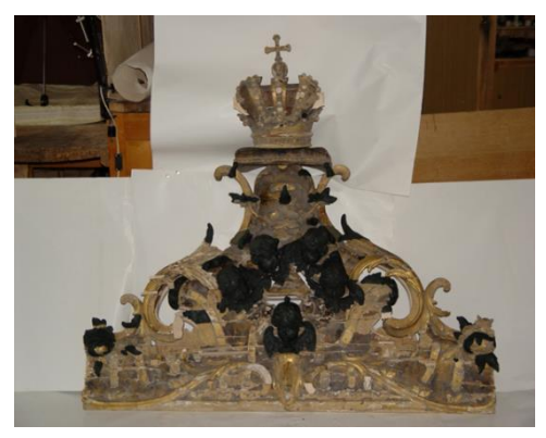
Figure 46. The upper frame listel to the temple icon Mikhail Malein and John the Warrior before the restoration of the losses of carved and sculptural decor with losses made up in soft material-plasticine