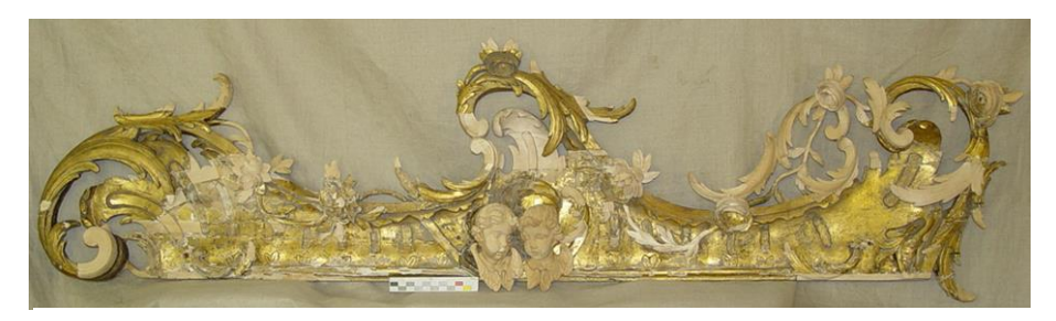
Figure 56. The left frame listel to the icon Mikhail Malein and John the Warrior in the process of recreating the loss of carved and ornamental decor in authentic material