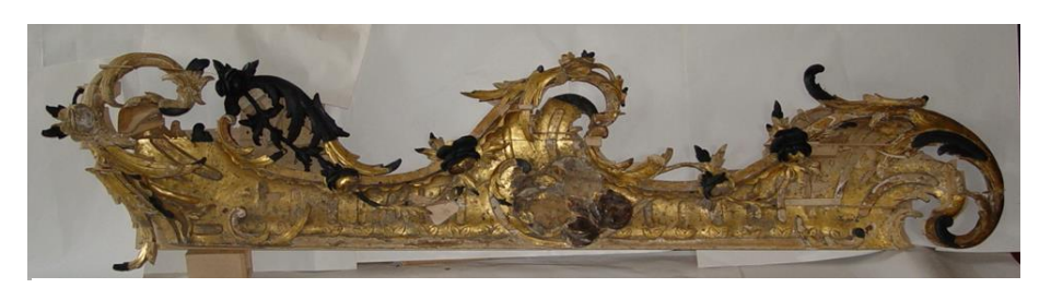
Figure 58. The right frame listel to the icon Mikhail Malein and John the Warrior in the process of modeling the loss of carved and ornamental decor