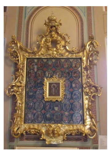
Figure 44. The frame to the temple icon after a comprehensive restoration of the base and decoration in the form of decorative combined gilding and reconstruction of the lost frame to the image of Nicholas the Wonderworker of the 17th century