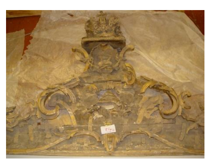
Figure 18. Frame for the temple icon Nicholas the Wonderworker in Life. The top listel is used before the restoration of the foundation and the restoration of its losses