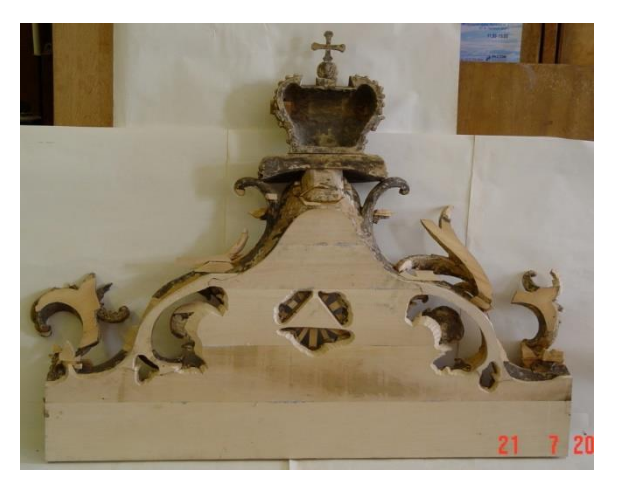
Figure 50. The back side of the upper frame listel to the temple icon Mikhail Malein and John the Warrior after duplicating the original carving of the 18th century on a new foundation