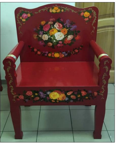
Figure 5. P. Voloshchuk. Furniture set Celebration . 2019