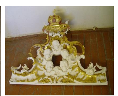
Figure 20. Frame for the temple icon Nicholas the Wonderworker in Life. The upper listel is in the process of restoration: local reconstruction of the losses of the levkas and removal of persistent surface contamination while preserving the historical gilding of 1909