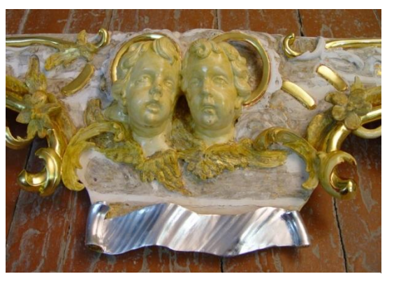
Figure 27. Fragment – the center of the lower leaf of the frame to the temple icon Nicholas the Wonderworker in Life in the process of resetting the decorative trim with a silver gilt lining on the ribbon, as an analogue of historical decoration