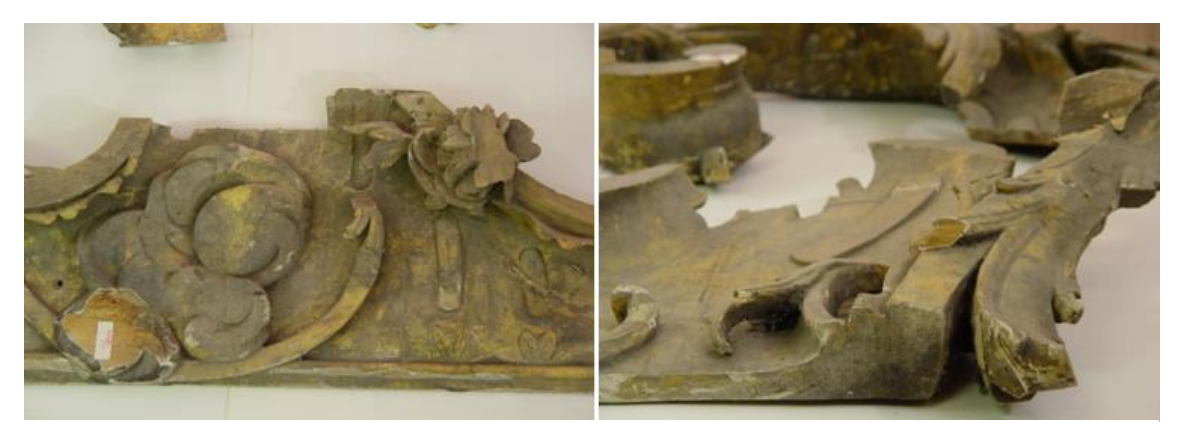
Figures 12-13. The loss of fragments of the carved decor of the frame and strong persistent surface contamination of the surface of the frame parts