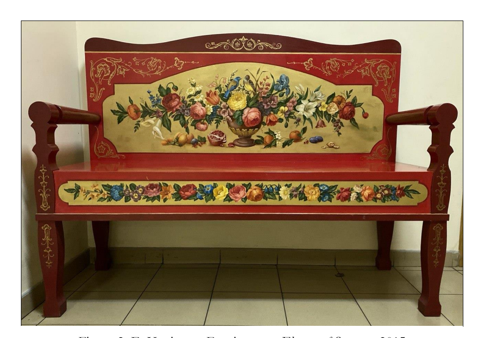
Figure 2. E. Kapizova. Furniture set Flowers of Summer. 2015