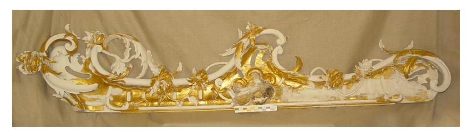
Figure 32. The right frame listel to the temple icon Nicholas the Wonderworker in Life in the process of preserving the historical levkas and local reconstruction of its losses, with the surface cleared of persistent contamination of historical gilding