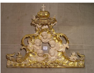
Figure 19. The frame for the temple icon Nicholas the Wonderworker in Life . The upper listel after the restoration of the loss of sculptural and ornamental decor