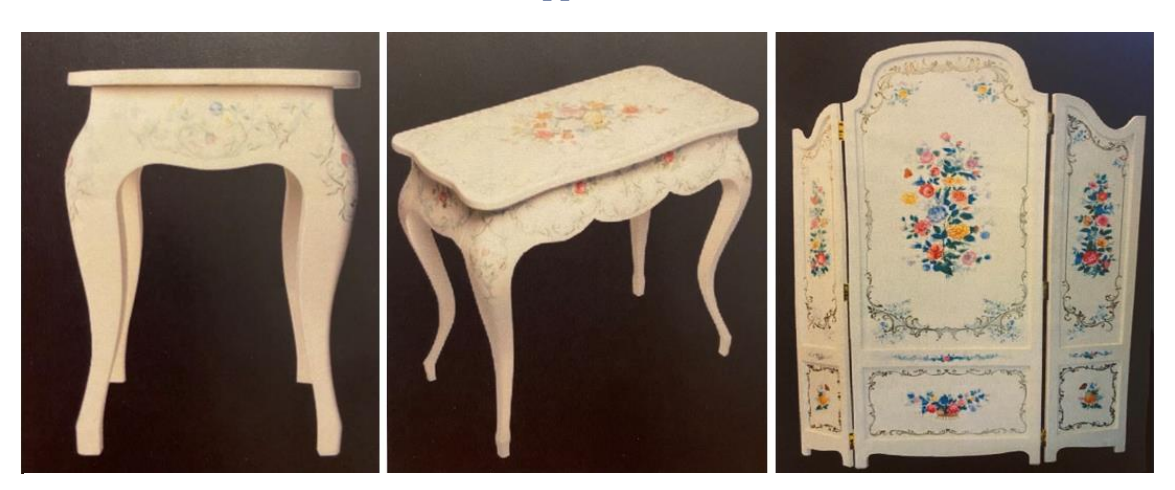
Figure 1. A. Yagovkina. Furniture set Tenderness. 2009