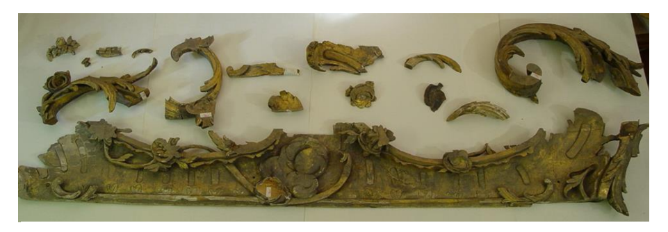
Figure 53. Search and selection of fragments for a specific part of the frame