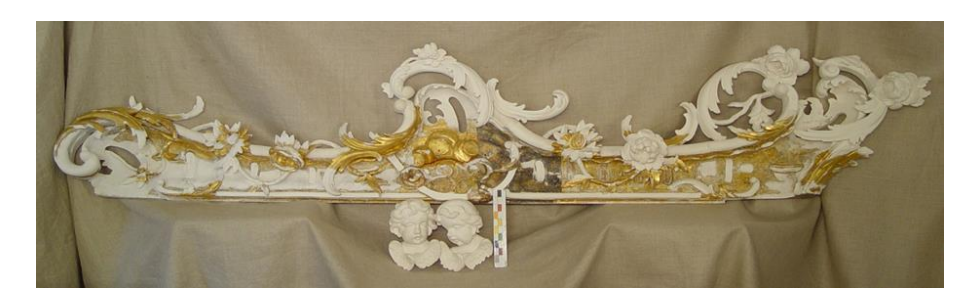
Figure 30. The left frame listel to the temple icon Nicholas the Wonderworker in Life in the process of preserving the historical levkas and local reconstruction of its losses with the control of clearing the surface from persistent contamination (in the center)