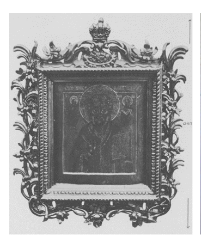
Figure 36. Iconographic material for the reconstruction of the lost work. Small frame to the image of St. Nicholas from the icon Nicholas the Wonderworker in the Life. Photo from the album of A.P. Aplaksin. Executed by K.K. Bulla in 1909