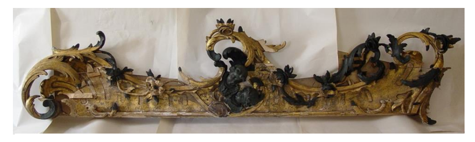
Figure 55. The left frame listel to the icon Mikhail Malein and John the Warrior in the process of modeling the loss of carved and ornamental decor