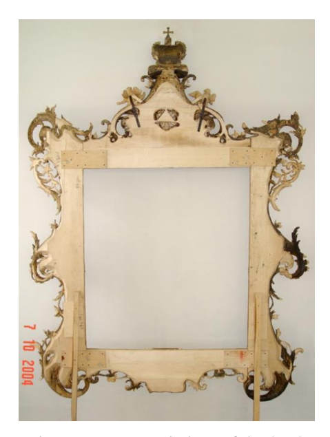
Figure 63. General view of the back side of the frame to the temple icon Mikhail Malein and John the Warrior in the process of duplicating the base and dry assembly of the frame