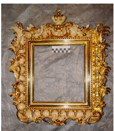
Figure 41. Performing glossy gilding on a polymer and covering areas of future matte gilding with alcohol shellac varnish