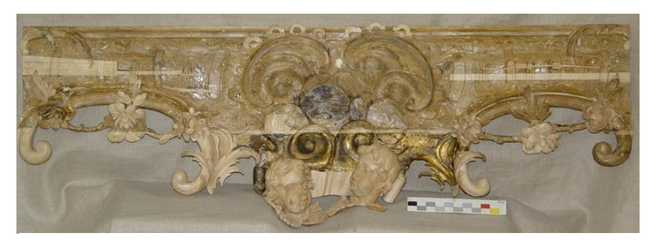
Figure 61. The lower frame listel to the icon Mikhail Malein and John the Warrior after recreating the carved and ornamental decor