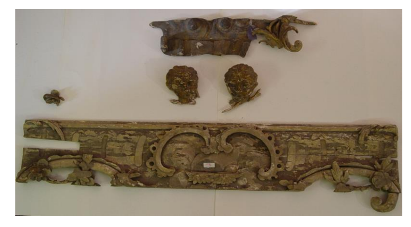
Figure 59. The bottom frame listel to the icon. Selection of fragments for the restoration of the base and carving