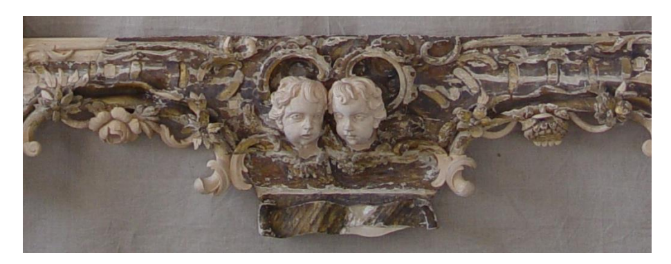
Figure 23. Frame for the temple icon Nicholas the Wonderworker in Life . The lower listel before the preservation of the historical soil and the removal of persistent surface contamination in the process of replenishing the loss of sculptural and ornamental decor