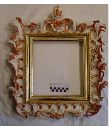
Figure 40. Reconstruction of the ground-levkas on the recreated frame to the image of Nicholas the Wonderworker . Designation of places of glossy gilding on the polymer