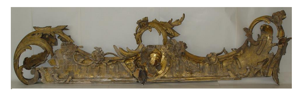
Figure 54. Search for the specific location of the identified fragment of the frame part to the icon