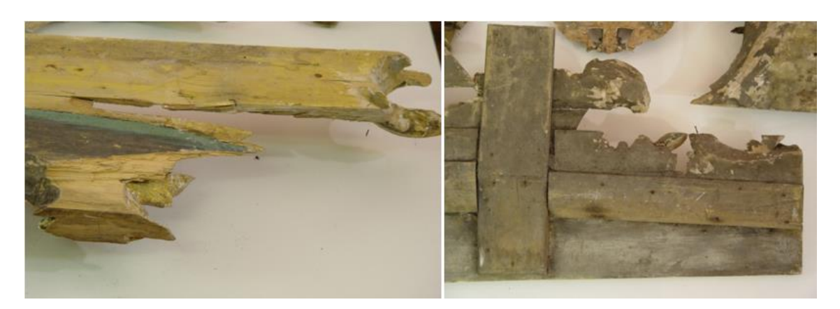
Figures 16-17. The loss of fragments of the carved decor of the frame and strong persistent surface contamination of the surface of the frame parts