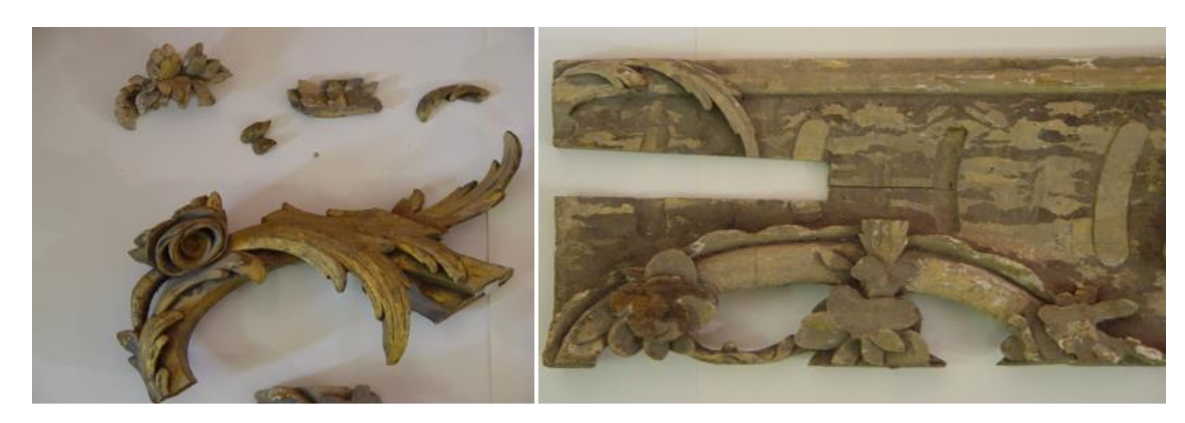
Figures 14-15. The loss of fragments of the carved decor of the frame and strong persistent surface contamination of the surface of the frame parts