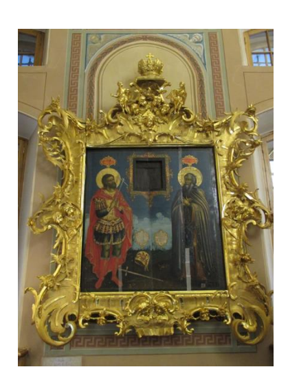
Figure 66. General view of the temple icon Mikhail Malein and John the Warrior in a frame after a comprehensive restoration of carved ornamental and sculptural decoration with gilding of two types without the icon of the Vladimir Mother of God and the frame to it in the upper part