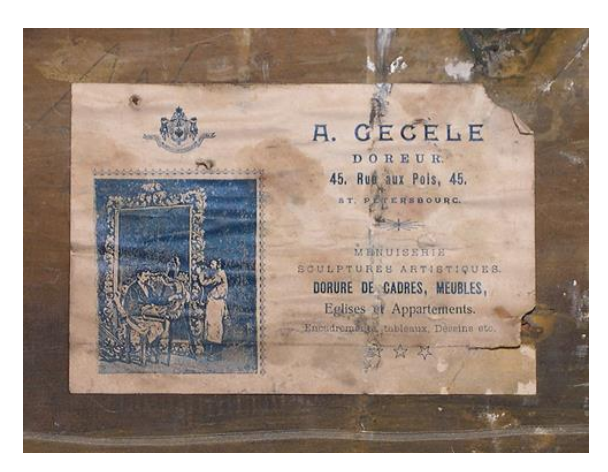
Figure 28. The label of A. Jessel's company, found on the back of the right listel to the temple icon Nicholas the Wonderworker in Life during the restoration