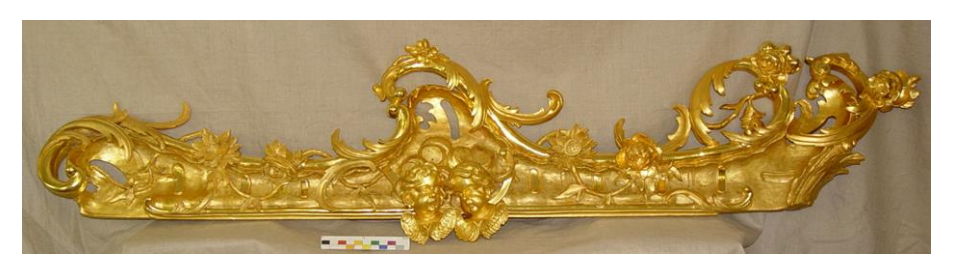
Figure 31. The left frame listel to the temple icon Nicholas the Wonderworker in Life after a complex of restoration works