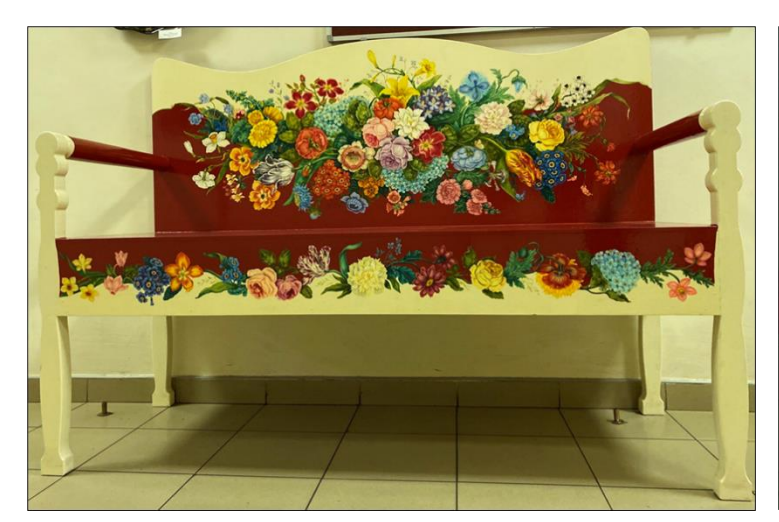
Figure 4. A. Ivanova. Bench Inspiration. 2018