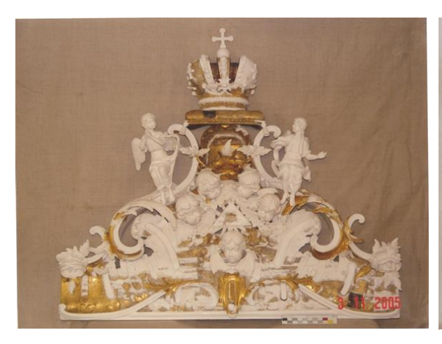
Figure 51. The upper frame listel to the temple icon Figure 52. The upper frame listel to the temple Mikhail Malein and John the Warrior after the restoration of the loss of carved and sculptural decoration, local reconstruction of the lost ground-