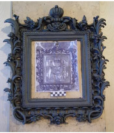
Figure 37. Reconstruction of the lost small frame to the image of Nicholas the Wonderworker based on the photo of K.K. Bulla in 1909. Execution of the model in a soft material