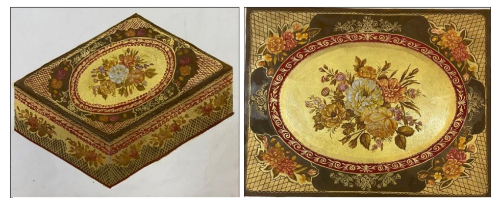
Figure 3. K. Grigorieva. The project of painting the casket. 2009