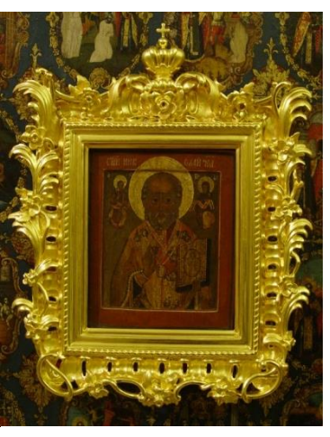
Figure 43. The image of Nicholas the Wonderworker of the 17th century in a recreated frame inserted into a niche on the icon of Life , according to the photo of K.K. Bulla, 1909