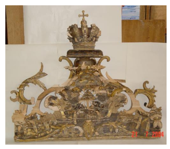
Figure 49. The upper frame listel to the temple icon Mikhail Malein and John the Warrior after the restoration of the loss of carved and sculptural decoration in the authentic material of the monument – linden wood