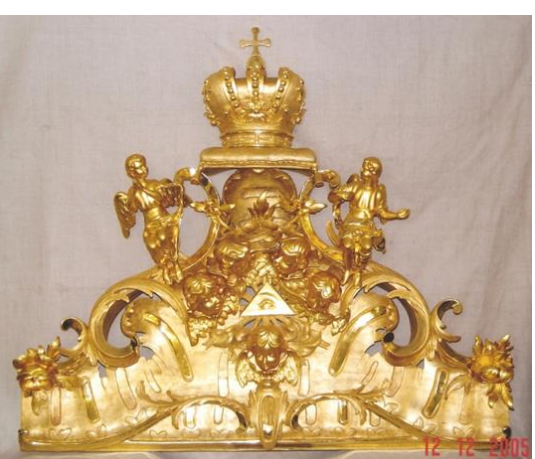
icon Mikhail Malein and John the Warrior after the restoration of the loss of carved and sculptural decoration, local reconstruction of the levkas and local decorative gilding on the polymer and lacquer with tinted restoration gilding to match the color of the preserved historical