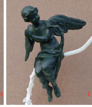
Figures 47-48. Small angels, models in soft material