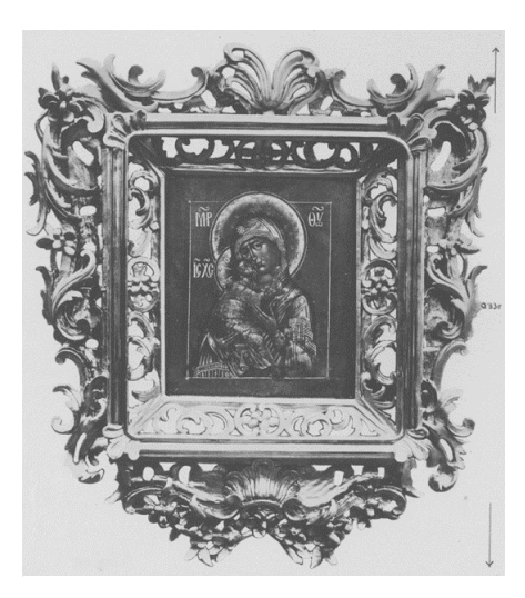
Figure 65. The icon of the Vladimir Mother of God in a carved gilded frame. Photo of 1909 from the album of A.P. Aplaksin