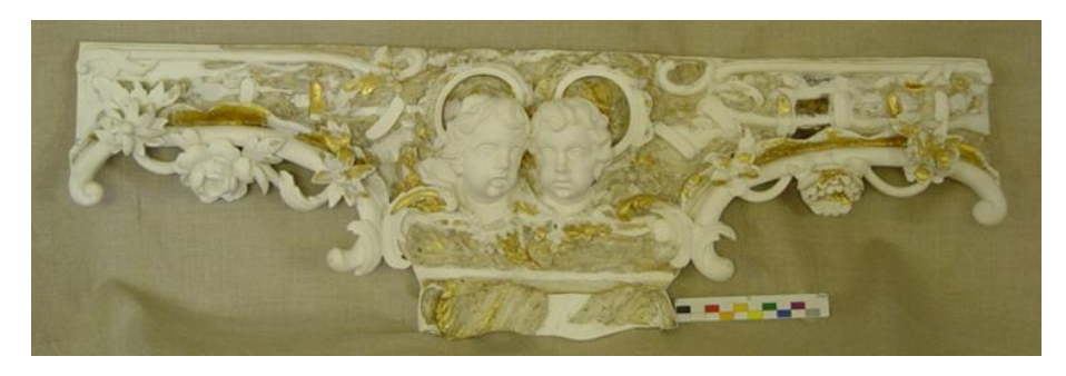
Figure 24. Frame for the temple icon Nicholas the Wonderworker in Life. The lower listel after the preservation of the historical soil, local replenishment of its losses and removal of persistent surface contamination