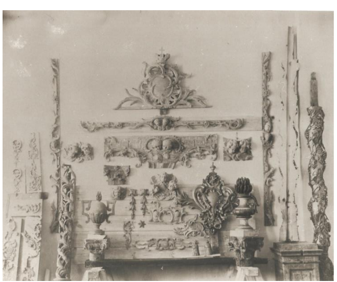
Figure 5. Details of the frames for the temple icons and the altar Canopy of the Sampson Cathedral in the process of restoration in the workshop. 1908.