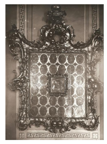
Figure 6. The frame and the temple icon Nicholas the Wonderworker in the Life of the Sampson Cathedral after the restoration of 1909