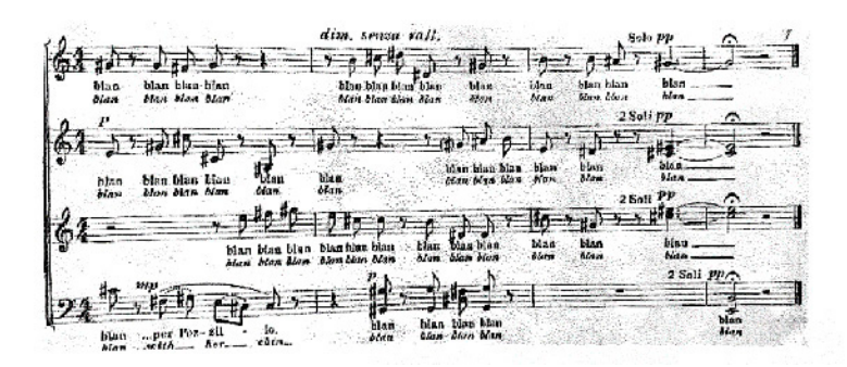
Figure 5. Goffredo Petrassi, Nonsense IV, mm. 38-41