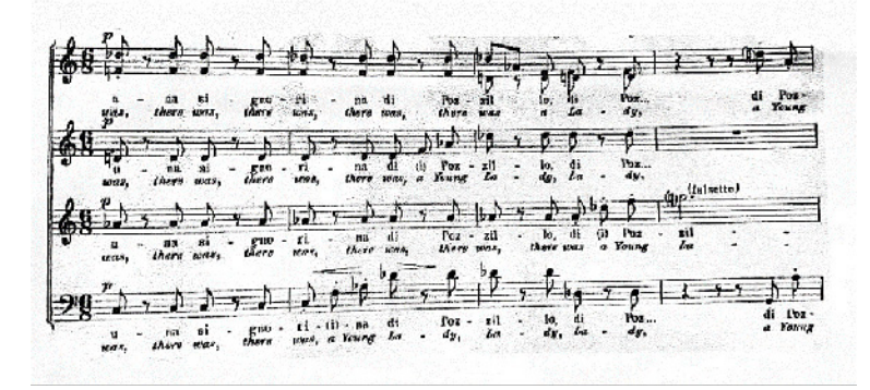
Figure 2. Goffredo Petrassi, Nonsense IV, mm. 10-13