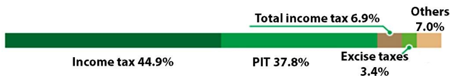
Figure 1. St Petersburg's budget revenues in 2022